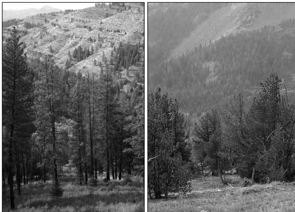
FIG. 1. Examples of seed-harvest stands used by Clark's Nutcrackers for Ponderosa Pine seed harvest (left) and Whitebark Pine seed harvest (right) from 2006 through 2009 in the present study.

caching. However, following the autumn–winter seed harvest season, all residents returned to the spring–summer home ranges and from midwinter onward, birds were always detected in the spring–summer home range. In other words, nutcrackers appeared to show strong fidelity for a relatively small core area near their capture site for all daily activities except autumn–winter seed harvest. But in autumn and early winter they ranged widely while searching for